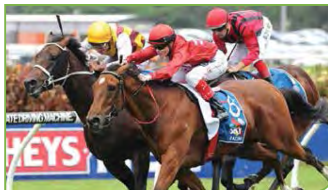
VOLKSTOK ‘N’ BARRELL WINS THE GROUP 1 2015 ROSEHILL GUINEAS

Volkstok’n’ Barrell had 10 starts as a three-year-old for six wins, one second and three thirds. His wins included the Group One Rosehill Guineas, the Group Two Great Northern Guineas, the Group Three Bonecrusher Stakes and the listed Karaka 3YO Stakes. He was second in the New Zealand Derby and third in the Australian Derby and Avondale Guineas.