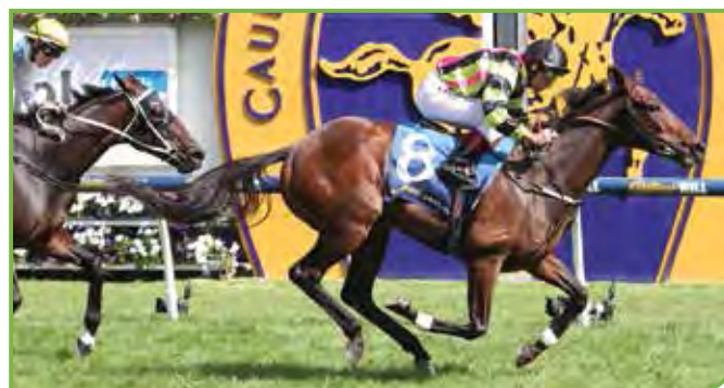
SUAVITO WINNING THE GROUP 1 FUTURITY STAKES

"What we do know is that we will keep calm and carry on and we won't be doing things any differently. We did what we thought was the best at the time and all credit to the people that handled the horses along the way right down to the jockeys in the last couple of minutes in a race".