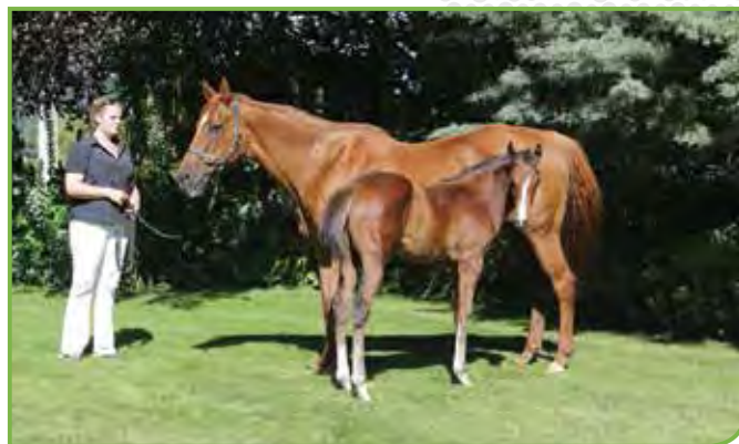
PARFORE AND HER YEARLING FILLY BY DARCI BRAHMA

When Parfore returned the following year to Australia she was