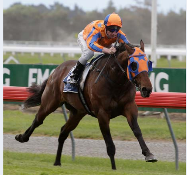
A 2013 service to Rock 'n' Pop (pictured above) will be won by an NZTBA member present at Te Aroha on the 6th of April

Entry cost will be $10 for financial members and $20 for