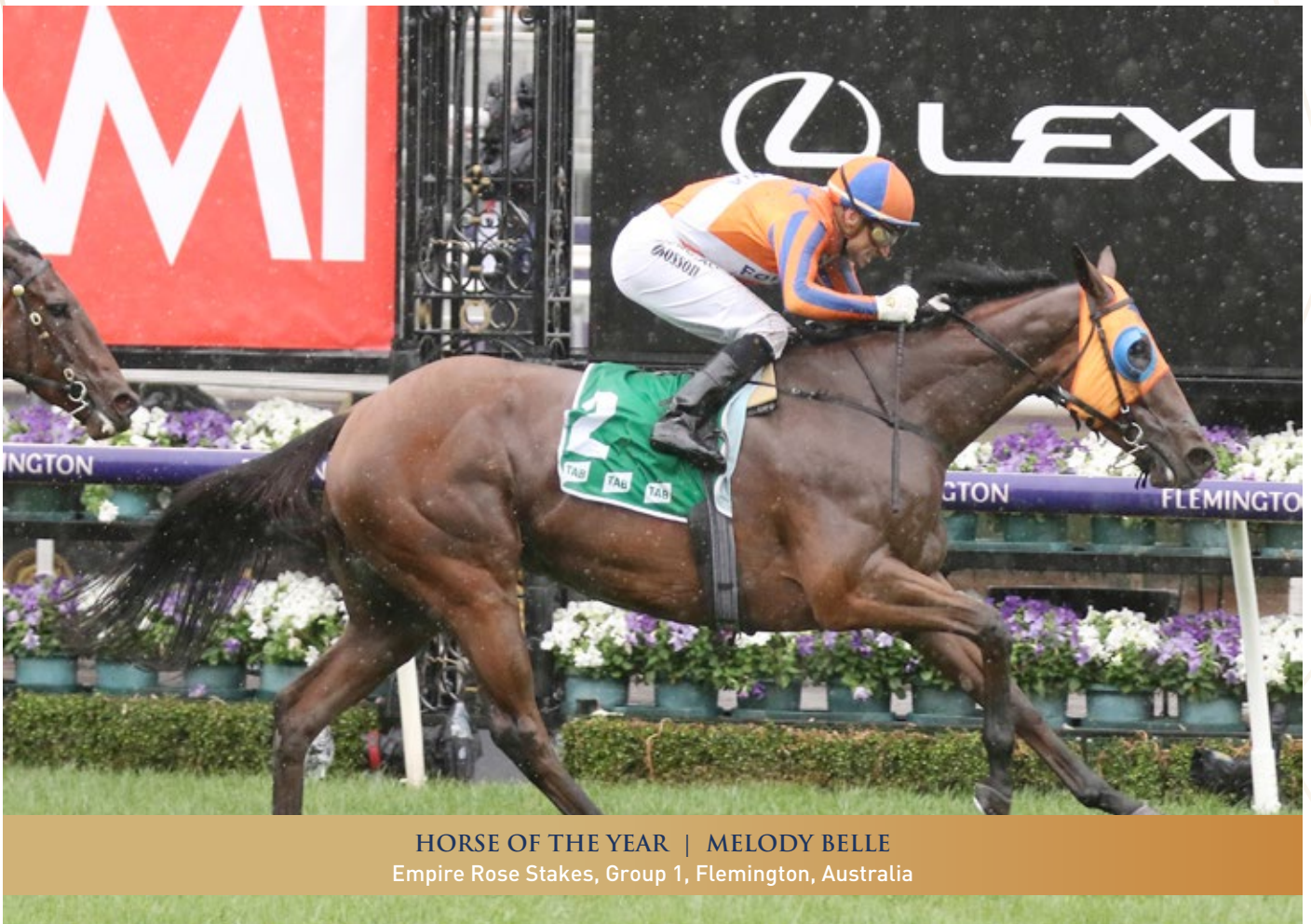
HORSE OF THE YEAR | MELODY BELLE Empire Rose Stakes, Group 1, Flemington, Australia