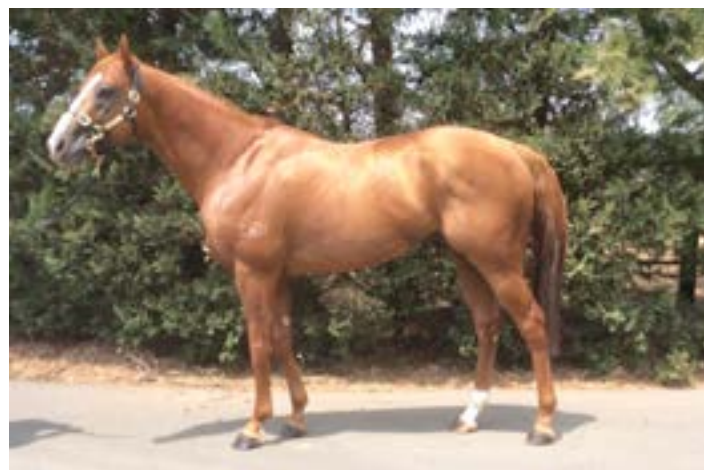
Sneaking to Win

Fast 'N' Famous, a Group Three winning son of Redoute's Choice(AUS), has to date sired nine black type winners including Queensland Oaks winner Quintessential and Railway Stakes victor In Style. Exported to Australia in 2014, he only served three seasons there before being sold to stand in Turkey.