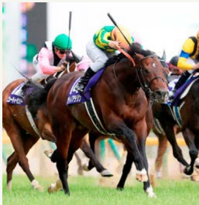
Satono Aladdin, the winner of the Gr.1 Yasuda Kinen (1600m).

"It's worldwide and that's just the way things are at the moment. All parties have been trying for some time to hopefully make it happen, but cost effectively it just can't be done."