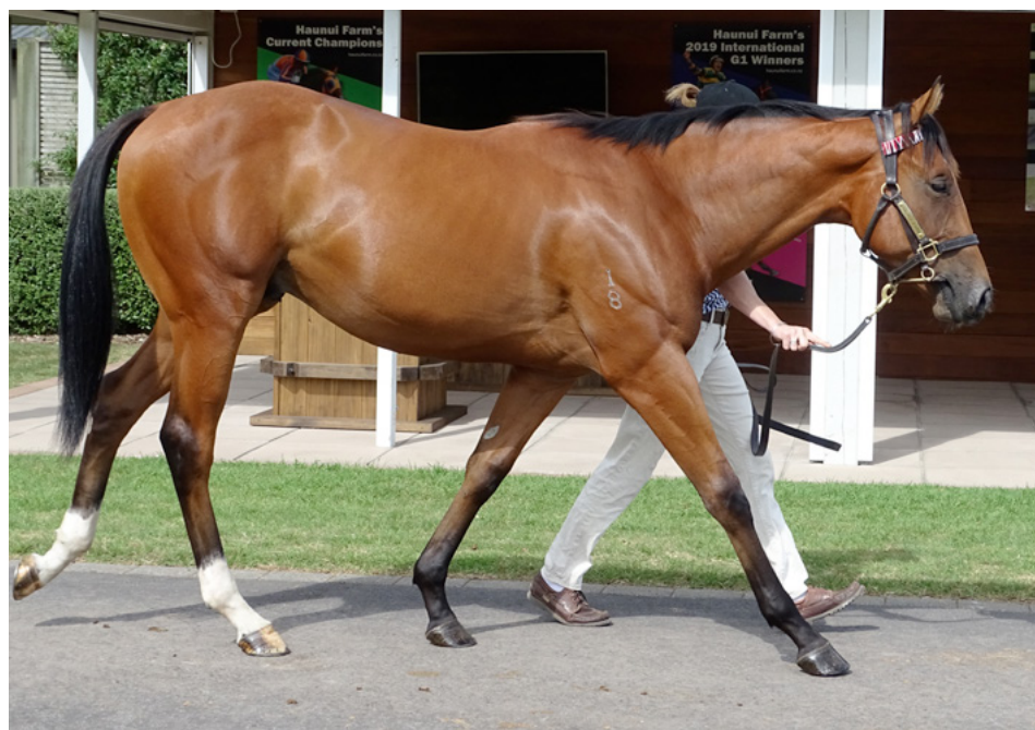
Lot 28 Showcasing (GB) from Kholes sold for $500,000