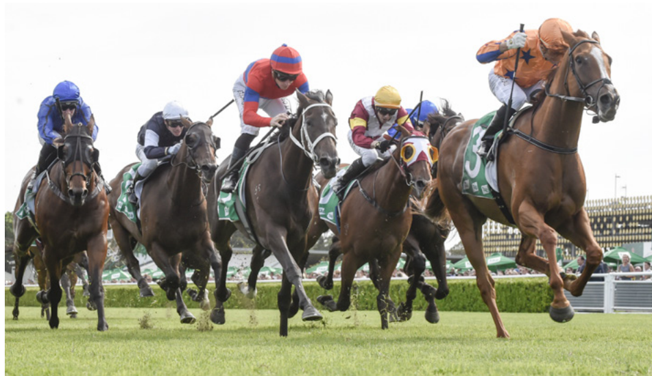
Te Akau Shark