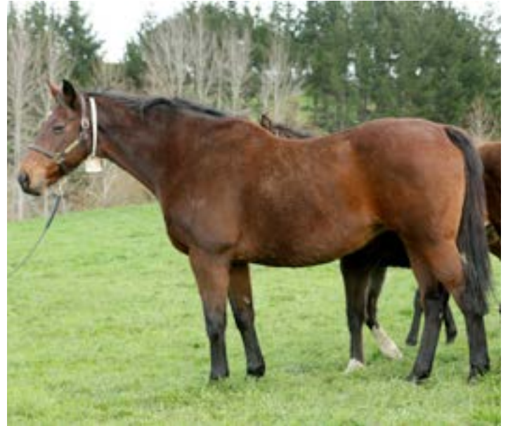
Fayreform looking after her mob of weanlings