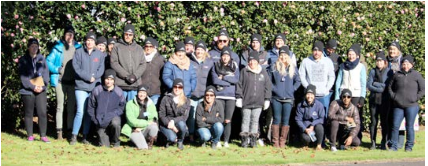
Participants in the 2018 Breeders Block Course

Recently our annual Equine Breeding Block Course was held and with spring still a few months away it was the ideal time of year to take the opportunity to host participants from stud farms and private farms nationwide.