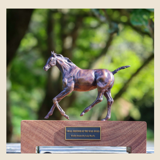
NEW ZEALAND SMALL BREEDER OF THE YEAR