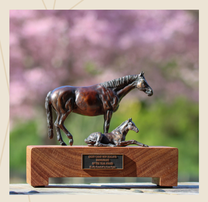
EIGHT CARAT BROODMARE OF THE YEAR