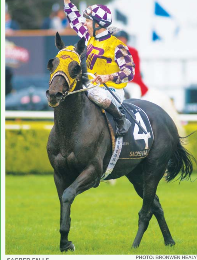
SACRED FALLS 4H O'REILLY – IGUAZU'S GIRL BY REDOUTE'S CHOICE ATC DONCASTER HANDICAP BREEDER: WAIKATO STUD 2001 LTD, MATAMATA