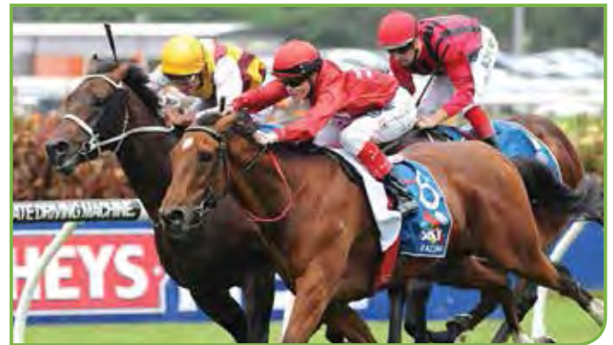
VOLKSTOK ‘N’ BARRELL WINS THE GROUP 1 2015 ROSEHILL GUINEAS

Volkstok’n’ Barrell had 10 starts as a three-year-old for six wins, one second and three thirds. His wins included the Group One Rosehill Guineas, the Group Two Great Northern Guineas, the Group Three Bonecrusher Stakes and the listed Karaka 3YO Stakes. He was second in the New Zealand Derby and third in the Australian Derby and Avondale Guineas.