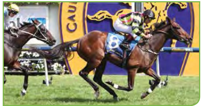
SUAVITO WINNING THE GROUP 1 FUTURITY STAKES

"What we do know is that we will keep calm and carry on and we won't be doing things any differently. We did what we thought was the best at the time and all credit to the people that handled the horses along the way right down to the jockeys in the last couple of minutes in a race".