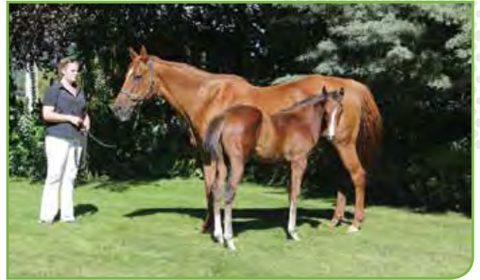
PARFORE AND HER YEARLING FILLY BY DARCI BRAHMA

When Parfore returned the following year to Australia she was