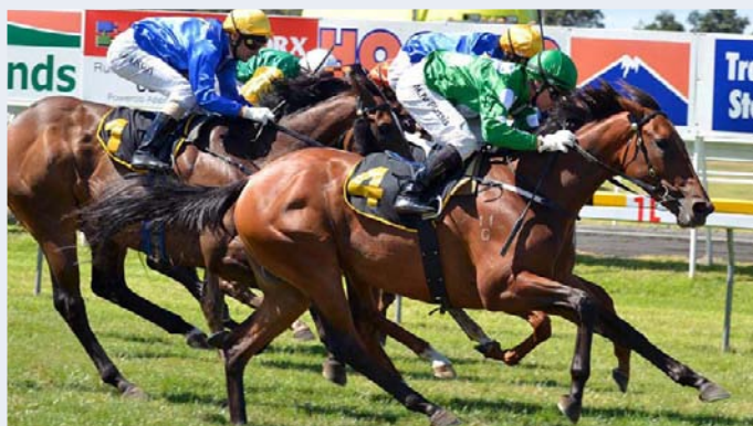
Girl Of My Dreams heads off her competitors in the Gr3 Taranaki 2YO Classic