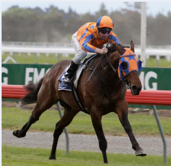
A 2013 service to Rock 'n' Pop (pictured above) will be won by an NZTBA member present at Te Aroha on the 6th of April

Entry cost will be $10 for financial members and $20 for non-financial members and guests (tickets can be purchased at the entrance).